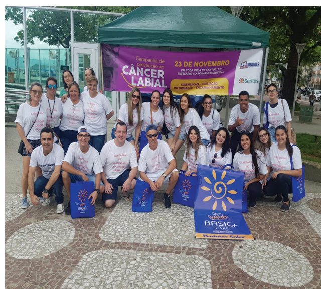
Lip cancer prevention campaign – Santos – SP.