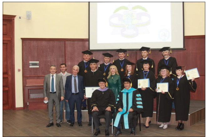
Figure 10: Group Picture of the ADI Newly Inductees.