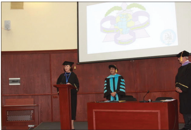
Figure 8: Address by the Newly inducted Prof. Iryna Mazur from Ukraine.