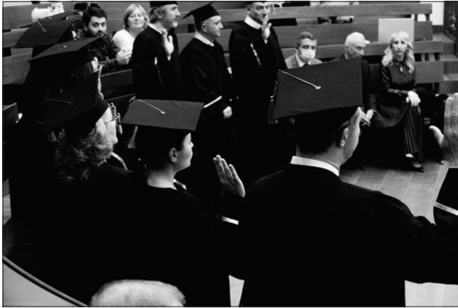
Figure 7: Taking the ADI Oath.