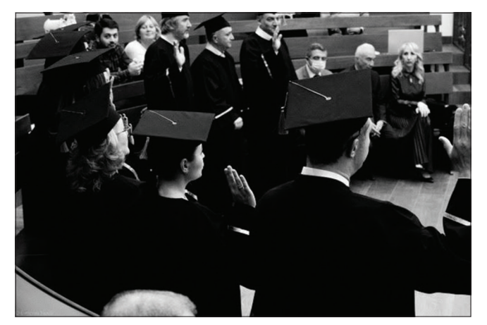
Figure 7: Taking the ADI Oath.