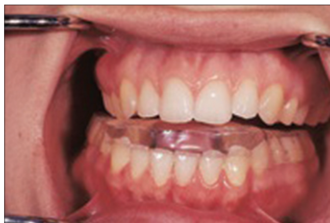
Figure 2: Anterior midpoint contact splint.

Two splints are given below, that is, soft splints and hydrostatic splints are considered pseudo-permissive