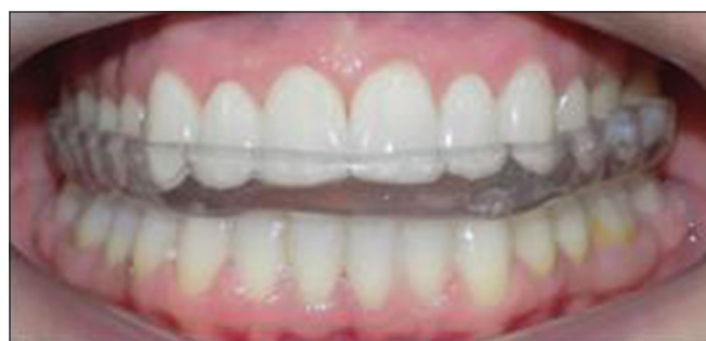
Figure 1: Intraoral maxillary occlusal splint.

The permissive splints allow the teeth to glide unhindered over the biting or contact surface. [5] The primary function of these splints is to alter the occlusion so that the teeth do not interfere with the complete seating of the condyles and to control muscle forces. Hence, these splints are also called