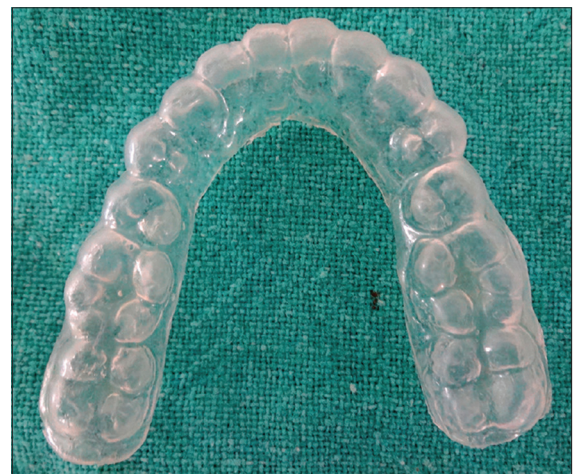
Figure 5: Soft splint.