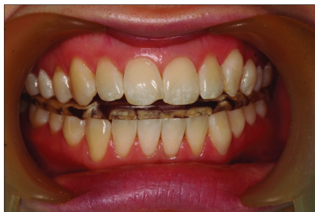
Figure 3: Full contact splint.